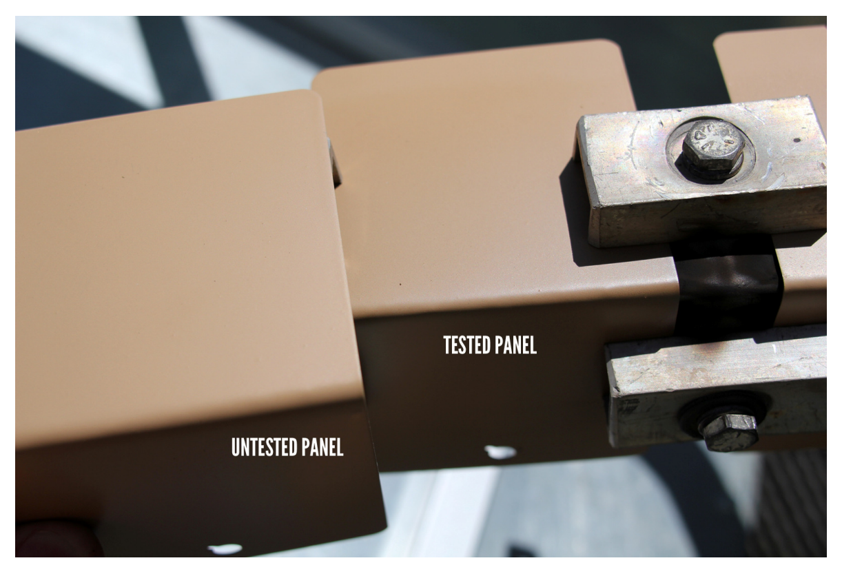
Figure 3. High Temp Brown, comparing before and after going through the exhaust system simulator.

Divisions of NIC: Prismatic Powders, Cerakote<sup>™</sup>, Prismatic Liquids, Thermo Dyne